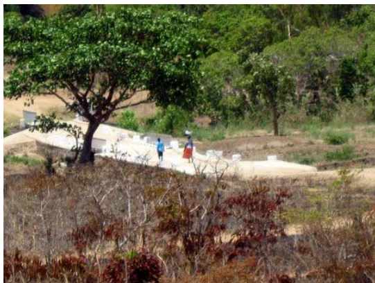
The bridge in use

I am happy to report that the 'Ubale Bridge' has given safe access throughout this period to the children walking to school and no school days have been lost as a result of being cut off by flooding. The community has benefitted immensely from this development.